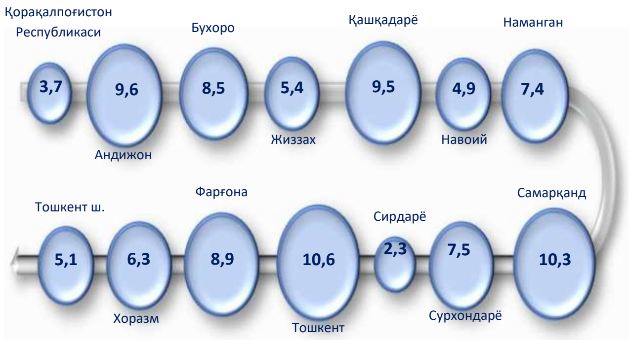
Figure 2 . In total self-employment income of regions share, % in (2022 year January-December state)

Independent respectively busy from being received of income main when analyzing the share, high indicators are mainly Tashkent - 10.6% , Samarkand - 10.3% , Andijan - 9.6% and Kashkadarya - 9.5% regions contribution right came On the contrary Syr Darya province – 2.3 % , In the Republic of Karakalpakstan – 3.7% and 4.9% in Navoi regions less share organize did So, it can be seen from this that Andijan region is second only to Tashkent and Samarkand provinces in our Republic.