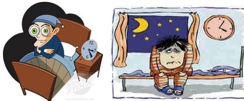
Figure – 1.

Various sleep disorders caused by psychoemotional factors were analyzed.