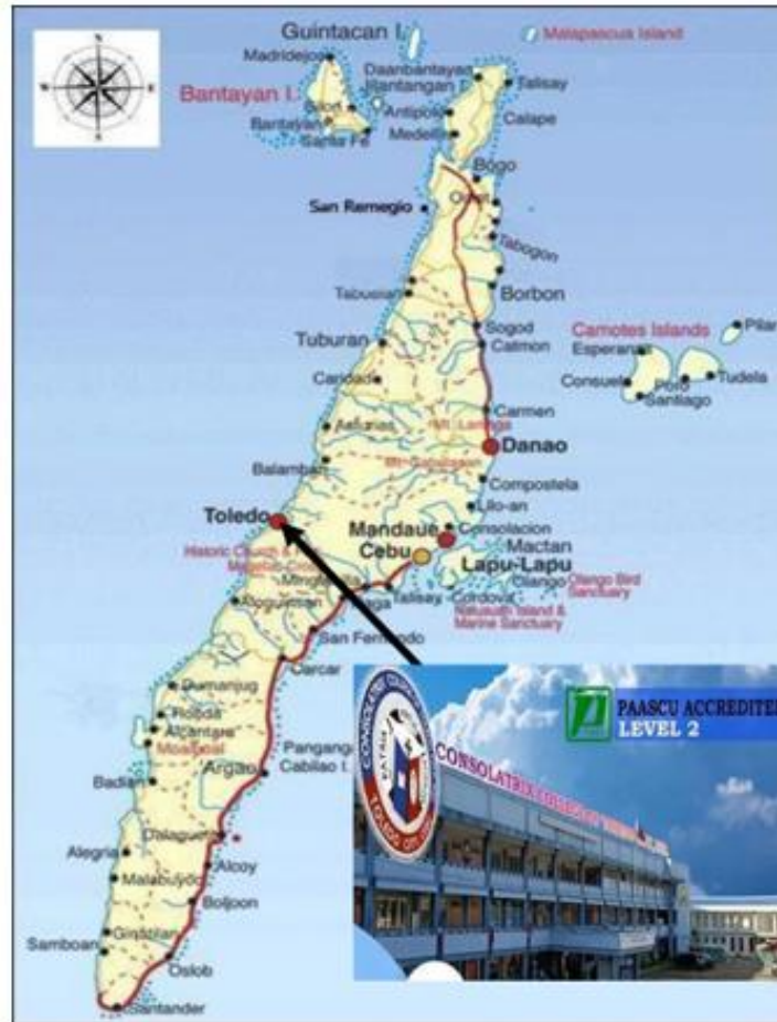
Figure 3. Location Map of Consolatrix College of Toledo City, Inc.

This study aims to explore whether integrating game-based warm-up activities at the start of Physical Education classes can raise both intrinsic and extrinsic motivation among these students. The participants of this study will be junior high learners in routine PE classes, who often face academic pressure and extracurricular demands that may weaken their motivation toward physical education. Incorporating brief game-based warm-up activities at the start of class offers an energizing and inclusive entry into exercise setting a positive tone without disrupting regular lesson flow. Delivered within a supportive school environment, this intervention seeks to enhance both intrinsic motivation (through enjoyment and engagement) and extrinsic motivation (via recognition and social reinforcement).