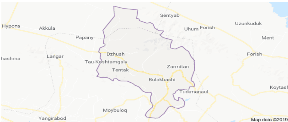
Figure 1. A cross-sectional view of the Koshrobot district.

Koshrobot is the name of a rural district and district center in Samarkand region. The first component of the toponym is the word Double , which means two or two. The word Rabat originally meant a building, a fortification, built for the military during the period when the religion of Islam began to spread. Later, it also meant a caravanserai (hotel). Khoshrobot means a place where two caravanserais are built side by side.