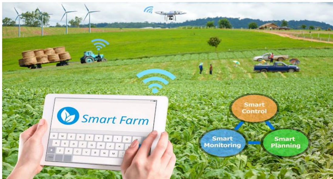
Figure 1. Real-time agricultural land monitoring technology

In Uzbekistan, considerable attention is being paid to targeted scientific research aimed at developing effective methods for data visualization and the preparation of electronic maps of agricultural lands using modern geoinformation systems, technologies, and remote sensing data[3]. These studies focus on data collection, storage, analysis, processing, evaluation, and the creation of geospatial databases. Therefore, improving the methodology for preparing electronic agricultural maps based on GIS and remote sensing data has become one of the urgent tasks of socio-economic cartography. The implementation of these tasks requires the development of theoretical and methodological foundations for agricultural mapping, as well as the creation of agro-geospatial databases related to agricultural sectors and infrastructure facilities, taking into account the socio-economic conditions necessary for agricultural development [4].